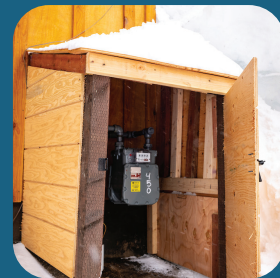
METER WITH SNOW SHELTER

Heavy snow and ice falling from roofs can damage natural gas meters, regulators, and associated natural gas piping. Special care must be taken when clearing roofs to prevent impact. Also, ice and snow accumulation, whether natural or manmade, can damage gas meters and outdoor appliances and create a hazardous leak.