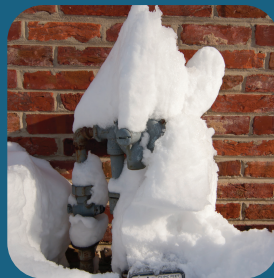
METER WITHOUT SNOW SHELTER